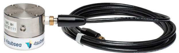
SMS Magic Hand™ for offshore use