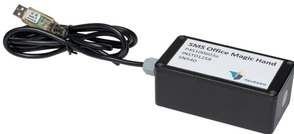
SMS Magic Hand™ office version

The sensor is designed and tested in accordance with ISO13628-6, API 17F.