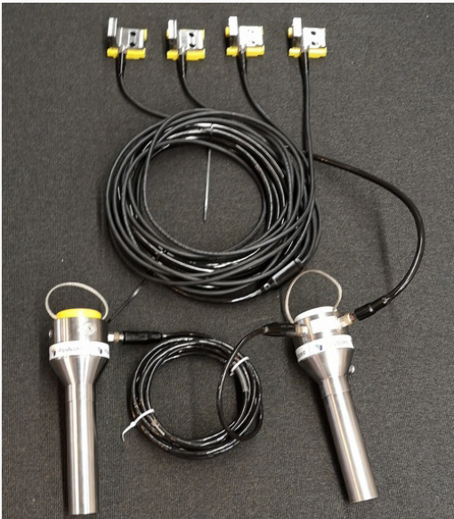
SMS Strain™ kit prepared for installation on BOP

System current consumption < 6mA Typical service life 12 months (2° C) Optional battery pack 36 months (2° C)