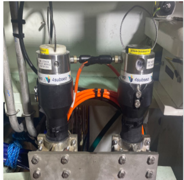
Offshore deployment of SMS Strain™